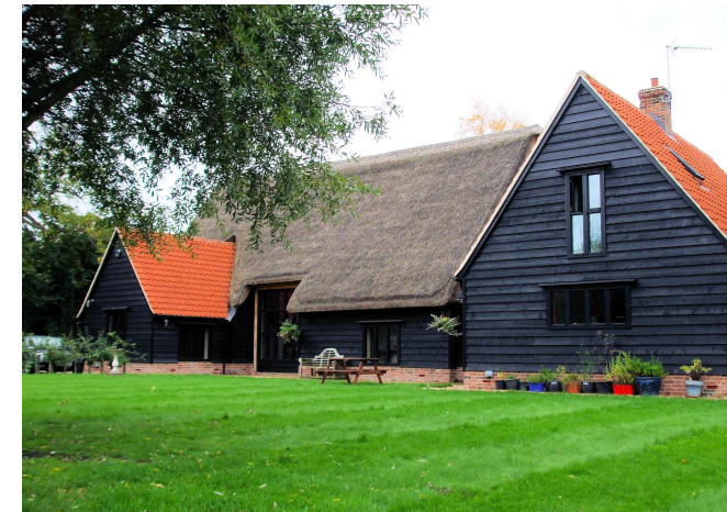
PAYNES FARM BARN KINGSTON