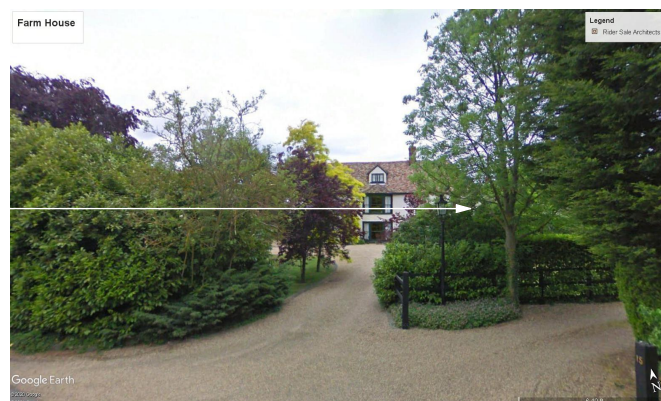
BARN AND LISTED FARM HOUSE BUILDINGS

PLANNING PERMISSION FOR A HOUSE APPROVED BETWEEN THE FARM HOUSE AND THE BARN S/1994/18/FL