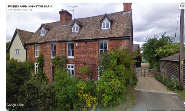
"ROOM IN ROOF" BARN STYLE HOUSE