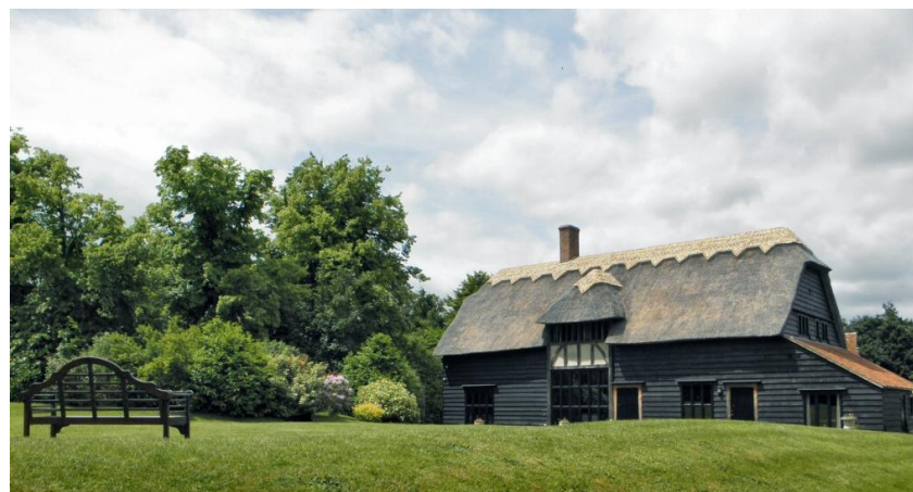
BARN CHURCH LANE LITTLE EVERS DEN