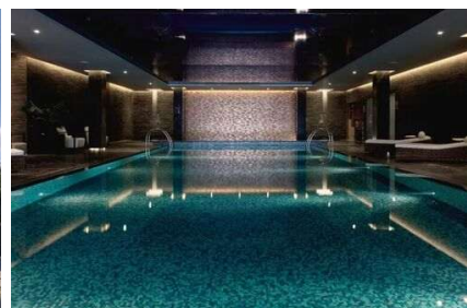
The Mulberry, 1 Banfield House, W6 9BH