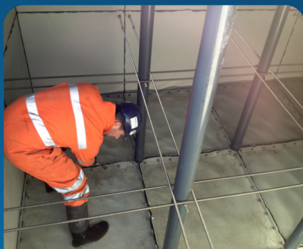
Before - showing hollow roof support struts installed