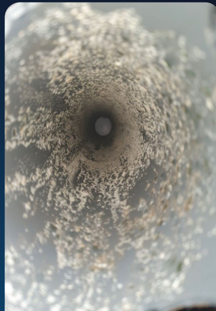
Internal view of GRP hollow roof support struts highlighting biofilm issues